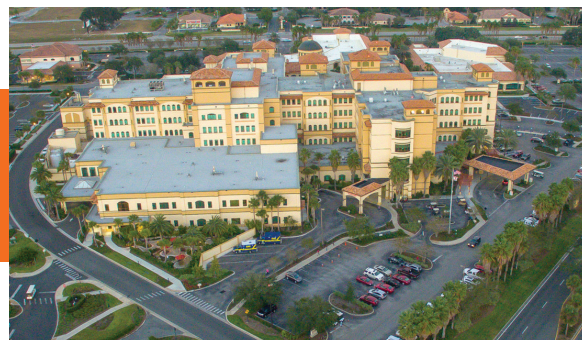
The Villages® campus