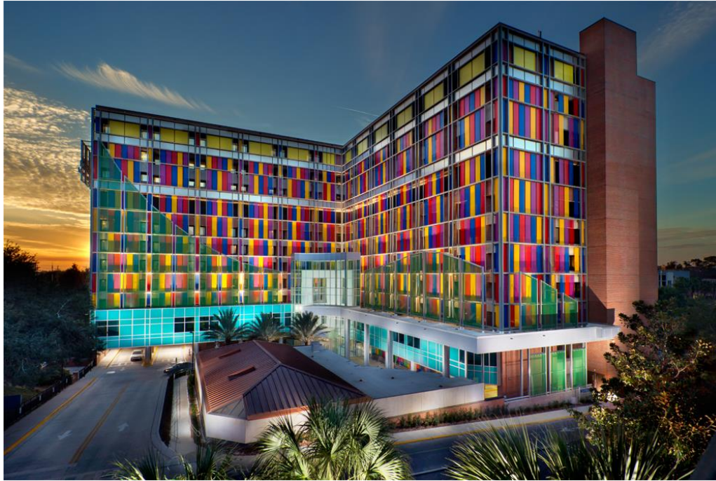
UF Health Shands Children's Hospital