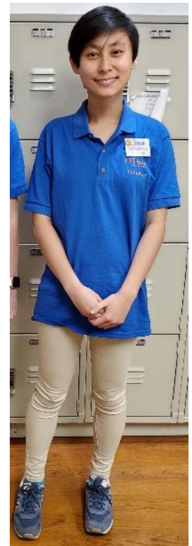
Volunteer wearing full uniform

If you arrive for your volunteer shift and are not in the proper uniform, you will be sent home and it will be considered a personal absence.